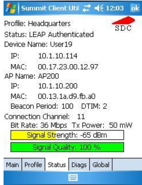
SCU is a graphical utility for configuration, troubleshooting, and management