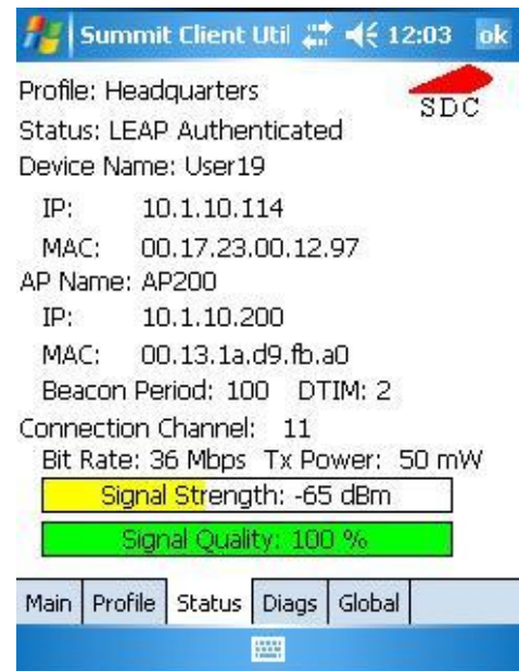
SCU is a graphical utility for configuration, troubleshooting, and management